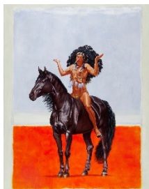
Kent Monkman, The Great Mystery, 2023, acrylic on canvas. Hood Museum of Art, Dartmouth: Purchased through the Miriam H. and S. Sidney Stoneman Acquisition Fund; 2023.18.1.

Please do not crop images without permission, and please never overprint images!